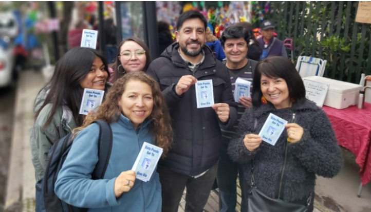
Part of the group showing their tracts.

From page one (This year it was 50,000 tracts)