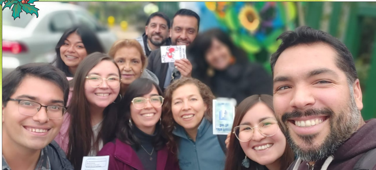
Part of the 100 Christians passing out 50,000 tracts on Memorial Day 2023 (story on page two)