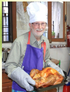
We pray you had a wonderful Thanksgiving.